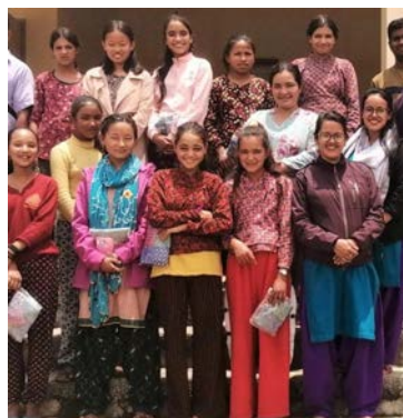
Mulkharka-area students receiving reusable sanitary pads