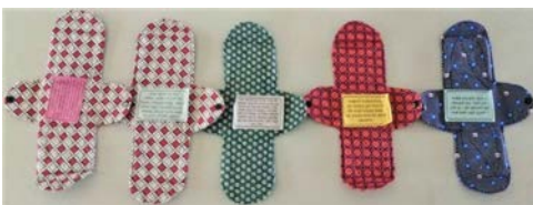
Reusable pads made by local women's group, promoted in schools and women's groups