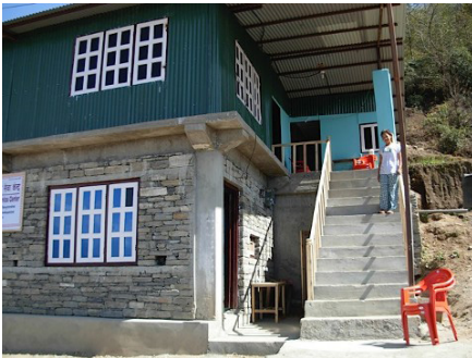
Mulkharka Clinic and nurses' quarters