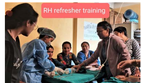
Nurse midwives participating in a refresher training course