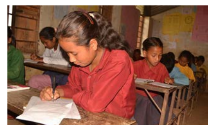
Girl studying in Ramechhap