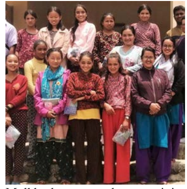
Mulkharka-area students receiving reusable sanitary pads