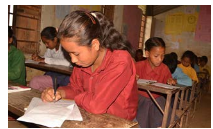
Girl studying in Ramechap