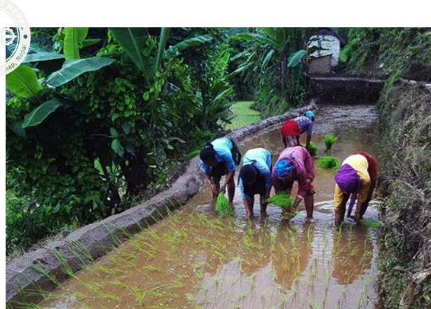
BSN scholars are helping their parents in paddy field.