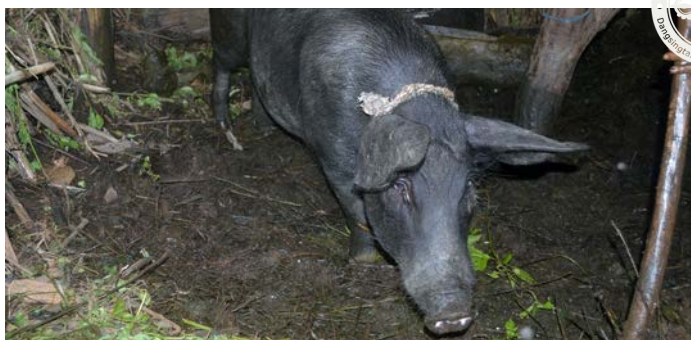
A pregnant female pig of Sukuna.