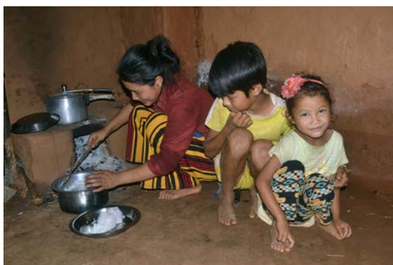
Sukuna prepares food for her & siblings