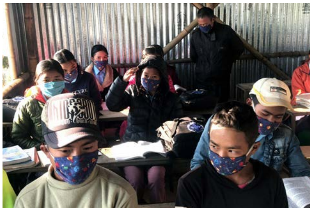
Students are taking private tuition after 1st lockdown caused by Covid 19 was over.

At the end of June of 2021, Janakalyan School Chyasku is preparing for online class for grade 8, 9 and 10's students. This will motivate students to learn in new method and stay connected with the course of study.