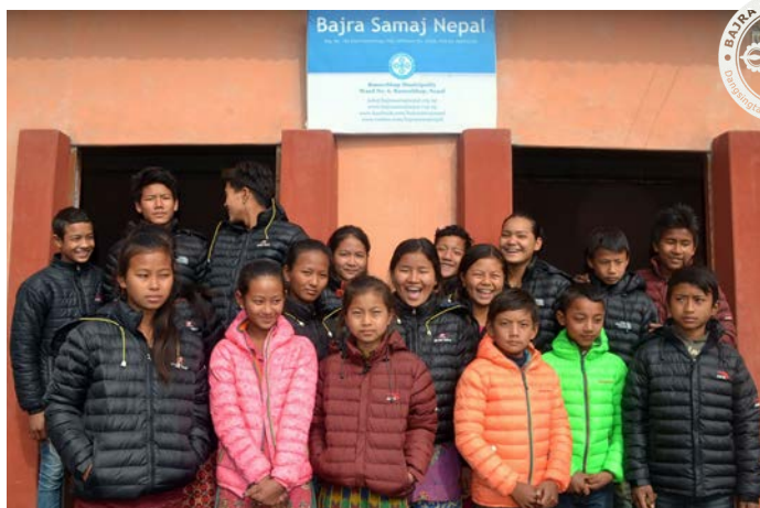
BSN scholars, after receiving jackets.