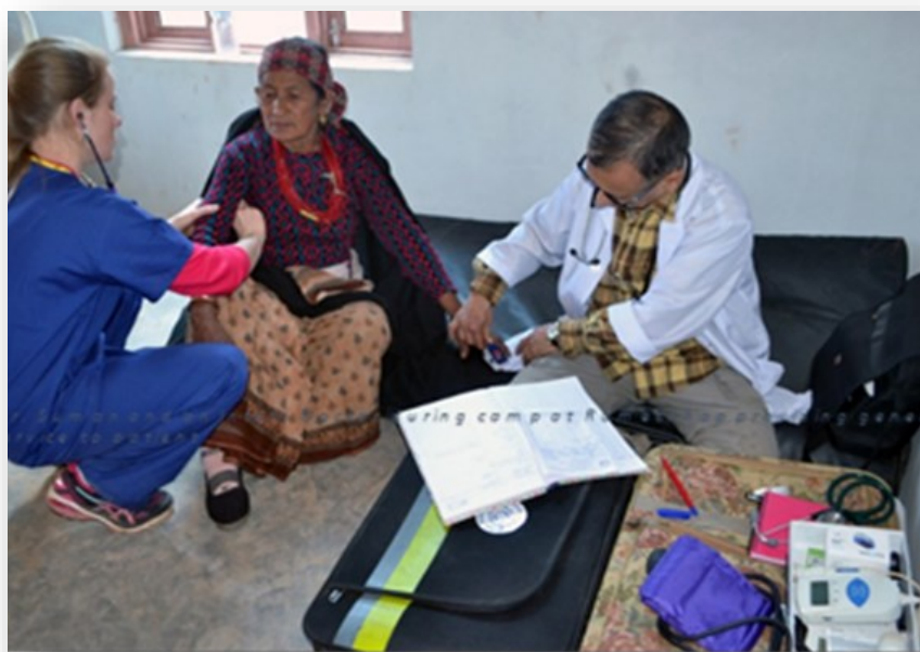
Woman getting her health check-up in the Camp