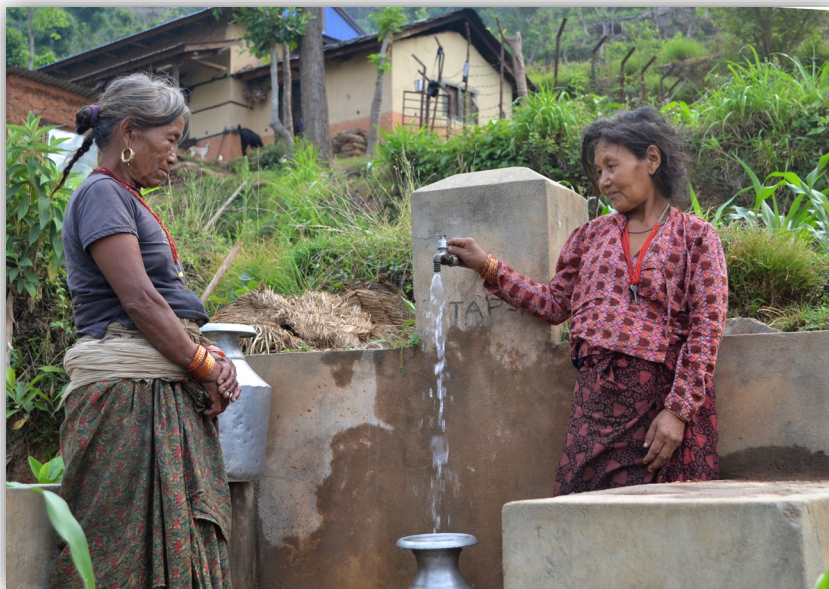
Local women collecting water after completion of Project

BSN was informed about the poor situations and approached by the community to solve the problems. A community drinking water project was designed and financially supported from Friends of Nepal Pariwar Foundation, the project for the construction of drinking water was initiated. The community was very encouraged and contributed a significant amount of contribution through their labor as a volunteer for carrying pipes, digging trench and fittings work. The project took 17 days to complete for which the community contributed approx. Nrs 56,000/- equivalent through their skilled and unskilled works. With the completion of infrastructure construction, the community now have access to sufficient and clean drinking water. The taps are constructed in the community in a walking distance of less than 5 min from their residence. With increased awareness about safe sanitation