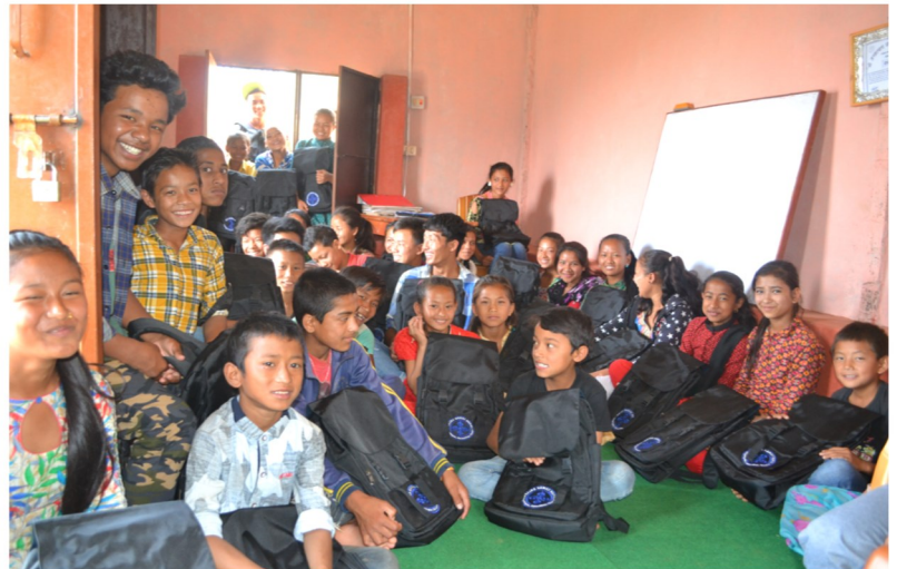
Students receiving scholarship supports

A core committee in the school is formed, who selects target students for scholarship program every year in respective school. In FY 2018/19 BSN provided scholarship to 38 students from Janakalyan Secondary School in Ramechhap Municipality. Among the selected students 50 percentage were girls, 13 percentage were Dalits and remaining were from Janjati. The students were provided with a school bag, stationaries with school uniforms. Additionally, 10 students from class 10 got tuition fees for their SEE preparation.