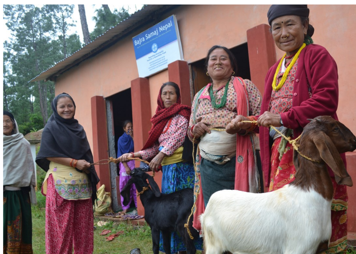
Receiving goat from group member as gift program of BSN

Community staff/facilitators facilitates and encourage women in groups to start saving with small amount on each month. It further provides capacity building trainings, orientation to group members on managing and mobilizing funds, maintaining records and providing infor-