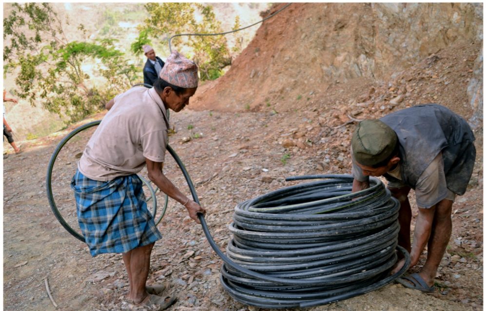
Users were preparing pipeline to carry up to water source from road