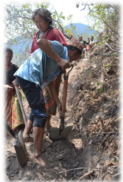
Locals making trench for pipeline in Community Drinking Water Project

The earlier drinking water source dried after April 2015, earthquake in the area. As the community was economically poor, they were unable to contribute financially and support the construction of a new distribution system. They made a request to various organizations as well as the local government but were unable to find a solution for it. As a result of using untreated and water from open source, infants and small children suffered from various water-borne diseases. Also, due to insufficient volume of water, the hygiene and sanitation condition of Kharkabesi were miserable.